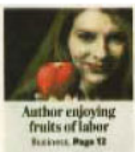
Author enjoying fruits of labor Business Page 12